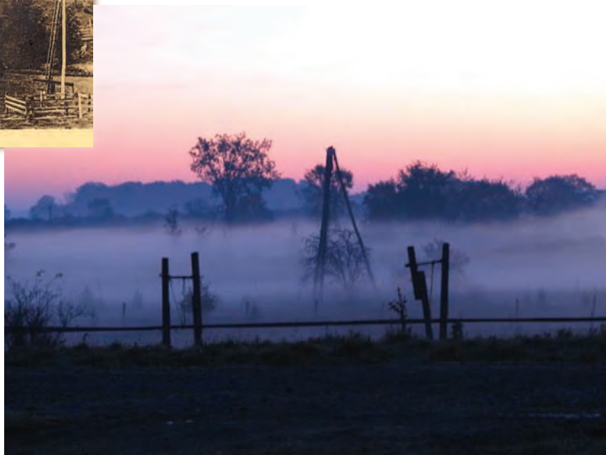
Sunrise at Fairbank Oil - a landscape virtually unchanged in more than 150 years.

411 GREENFIELD ST | PETROLIA, ON | N0N 1R0 | 519-882-2350 | WWW.TOWN.PETROLIA.ON.CA