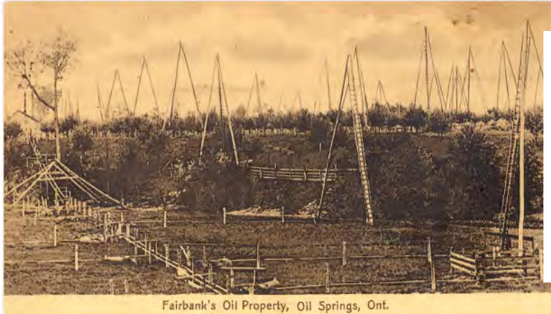
Fairbank's Oil Property, Oil Springs, Ont.