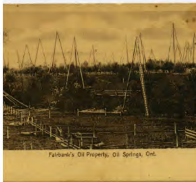
Fairbank's Oil Property, Oil Springs, Ont.