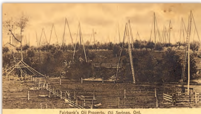
This postcard of Fairbank Oil is from about 1900.

Learn about the bid Ask Questions Show your support!