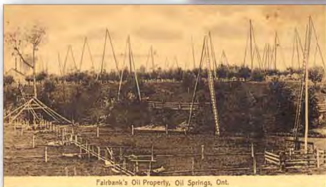
Fairbank's Oil Property, Oil Springs, Ont.