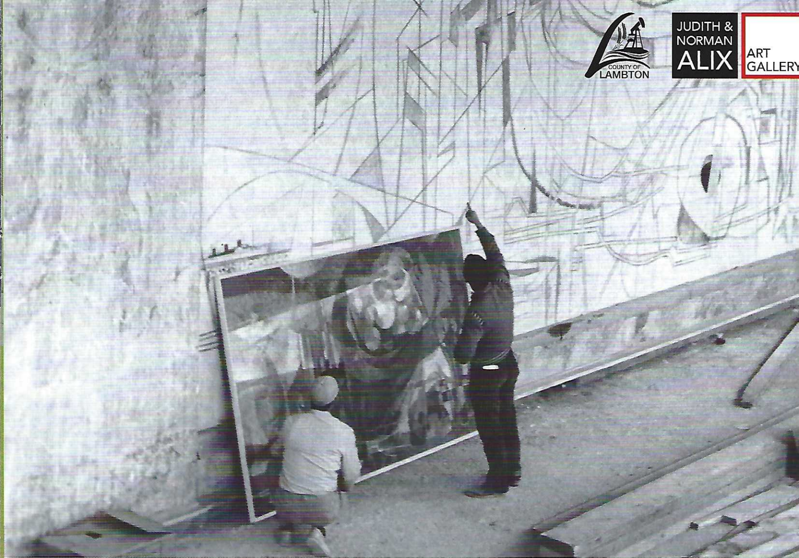
The Story of Oil cartoon was photographed and projected onto the walls of the lobby using Kodachrome slides, at which point the mural was sketched out directly onto the wall with India ink.