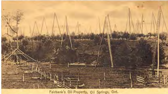
Fairbank's Oil Property, Oil Springs, Ont.

If you're an early riser, tune in to CBC Radio One at 6:12 tomorrow morning (Wed) to hear Charlie Fairbank discuss Fairbank Oil Fields joint application with the County of Lambton for UNESCO World Heritage Site designation.