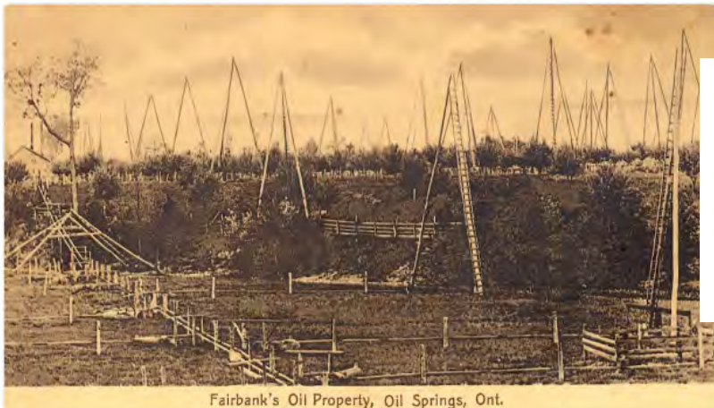
Fairbank's Oil Property, Oil Springs, Ont.