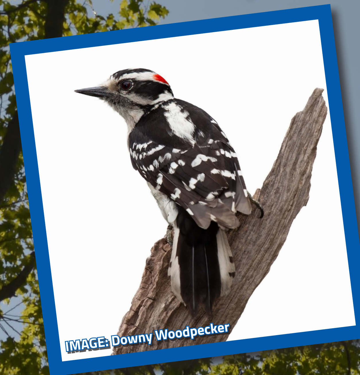
IMAGE: Downy Woodpecker

The most common and smallest species of woodpecker locally is the downy woodpecker ( Picoides pubescens ). Their colouring is checkered black and white, and males have a small red patch on the back of their heads. Listen for their pecking sound and see if you can glimpse holes they made in the trees.