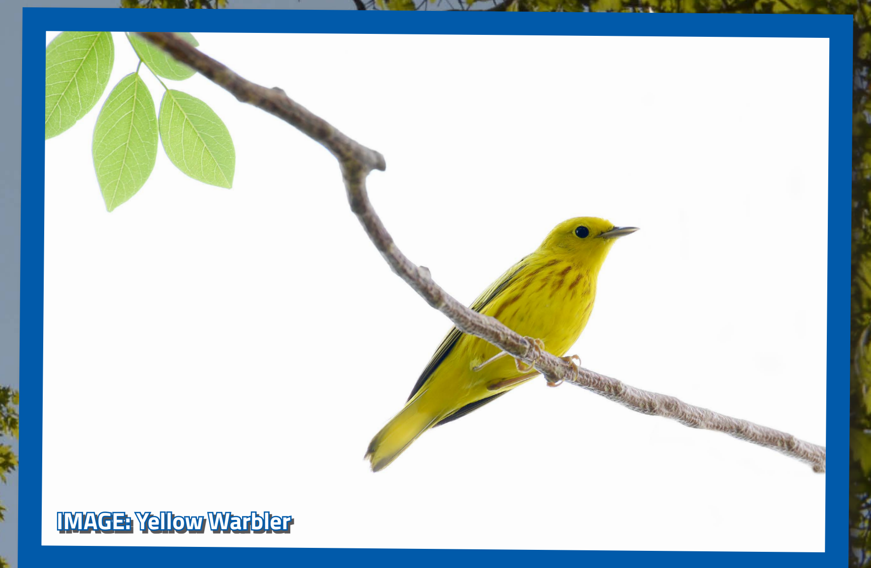
IMAGE: Yellow Warbler