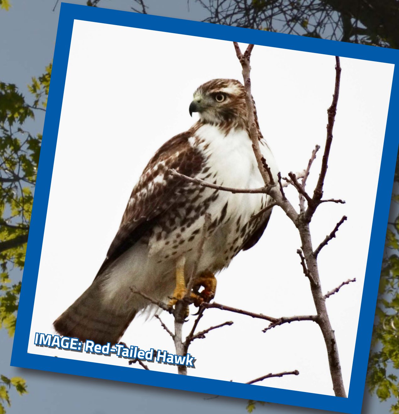
IMAGE: Red-tailed Hawk

The yellow warbler ( Dendroica petechia ) is an exceptionally bright spot of colour. It is a small songbird with a medium-length tail and rounded head. These birds eat insects and their straight, thin bills are relatively large.