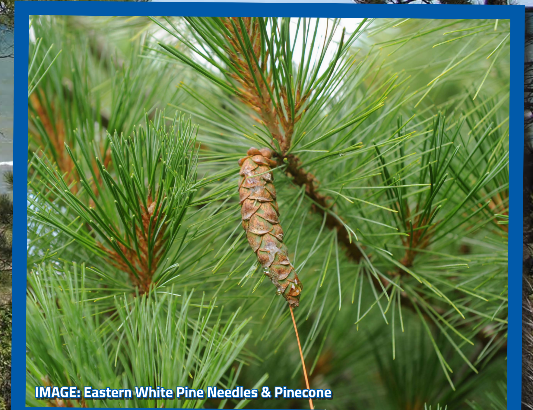
IMAGE: Eastern White Pine Needles & Pinecone

Eastern white pine ( Pinus strobus ) was adopted as the Provincial Tree of Ontario on May 1, 1984. It is the tallest tree in the province, often reaching 150 feet in height. It can also live for over 250 years!