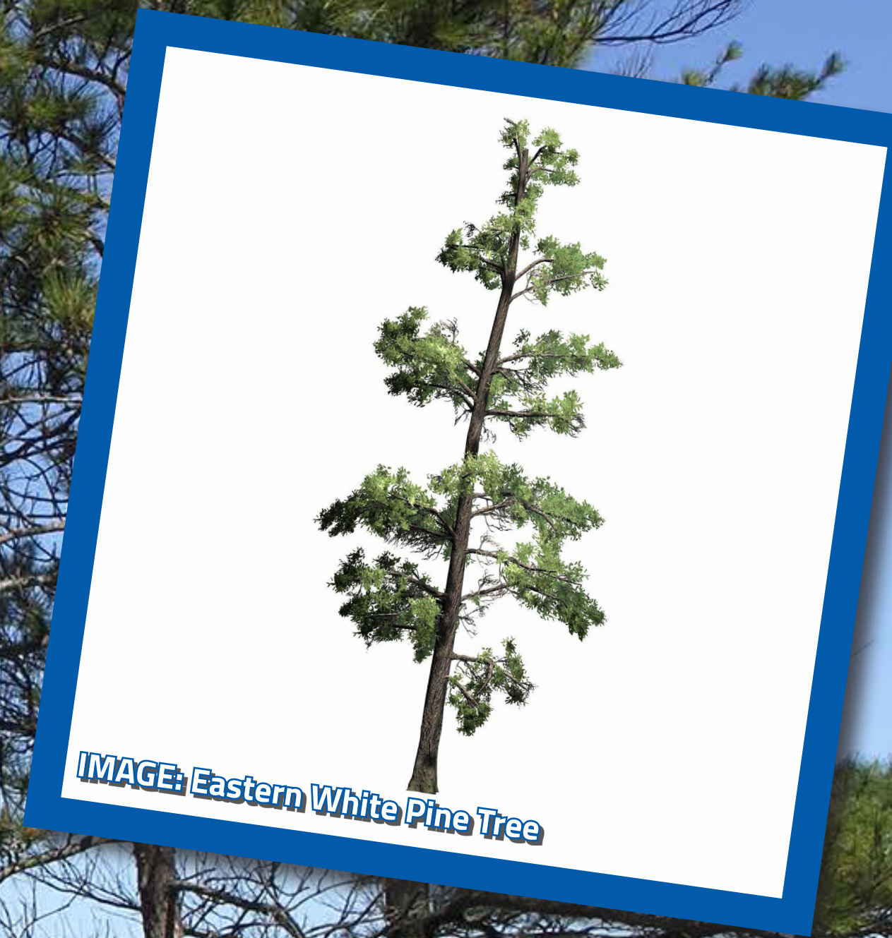
IMAGE: Eastern White Pine Tree

White pine is significant in other ways. It was very important to Ontario's early economic development. Pine logging was a key Canadian industry in the 1800s. Local lumbermen floated pine logs down the Ausable River to Lake Huron for shipping around the world. The wood is light, durable, and easy to shape. The long, straight trunks were also valued for making ship's masts.