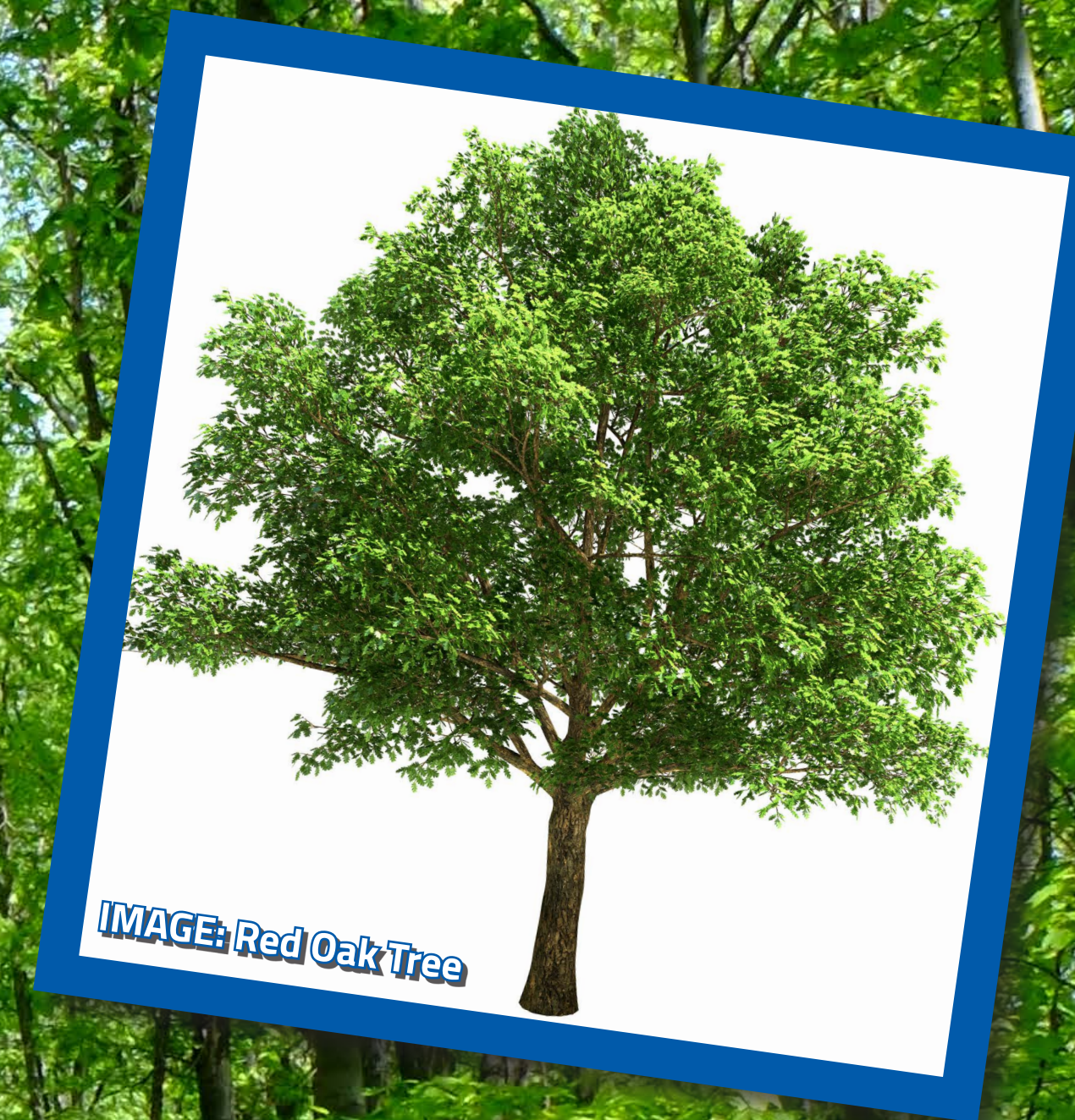
IMAGE: Red Oak Tree

The museum is surrounded by a unique oak savanna habitat. A savanna is an area where trees are not dense. This allows grasses and other smaller plants to thrive. Savannas can be found around the world with different types of dominant trees. The 30-acre museum site features oak as the dominant tree. You will see tall oak trees surrounded by relatively open grasslands during your walk along the trail.