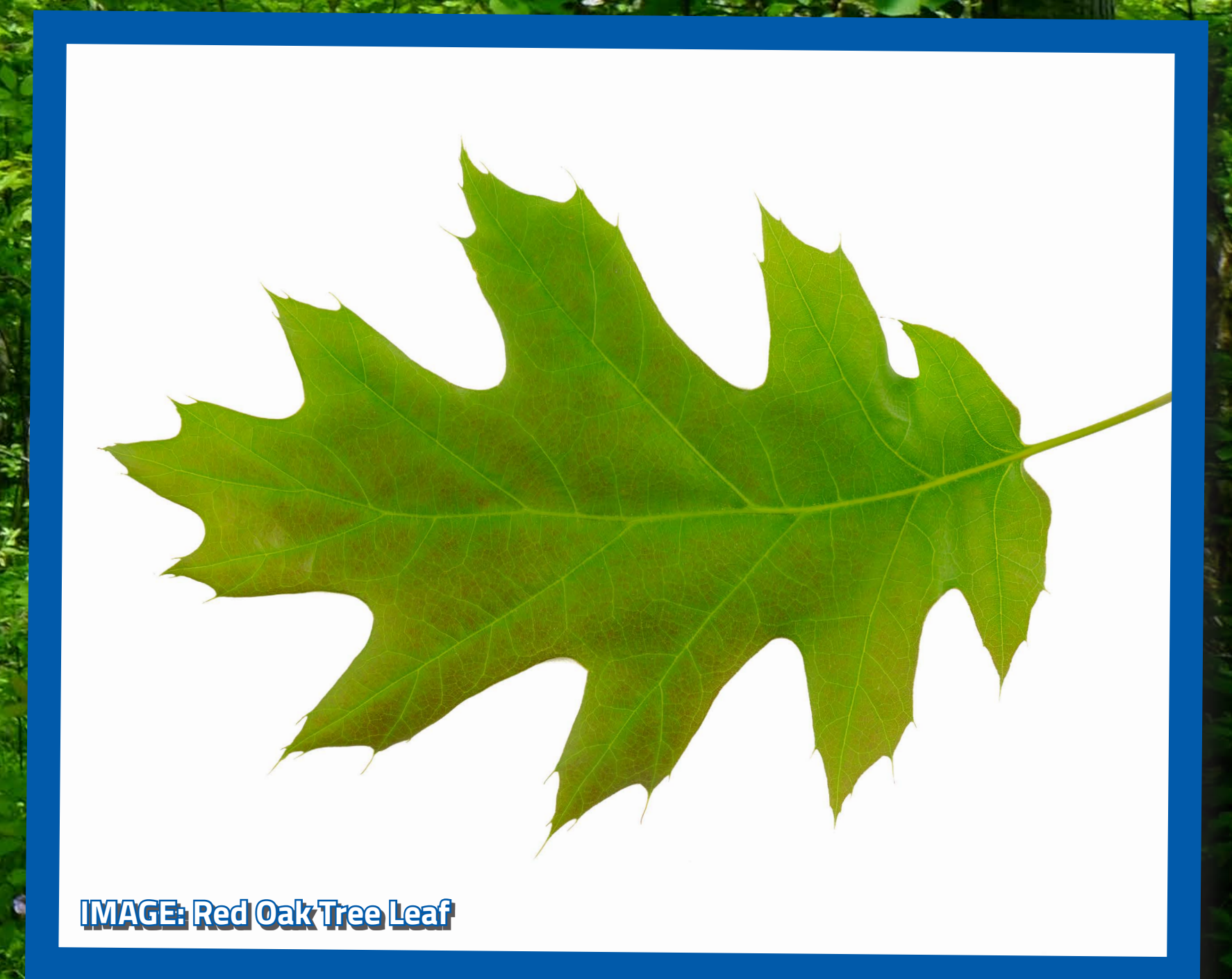
IMAGE: Red Oak Tree Leaf

Over the past 200 years, 99.93% of the oak savanna habitat in the world has disappeared. The largest remaining example of this habitat is found right here and includes Pinery Provincial Park and its adjacent woodlands.