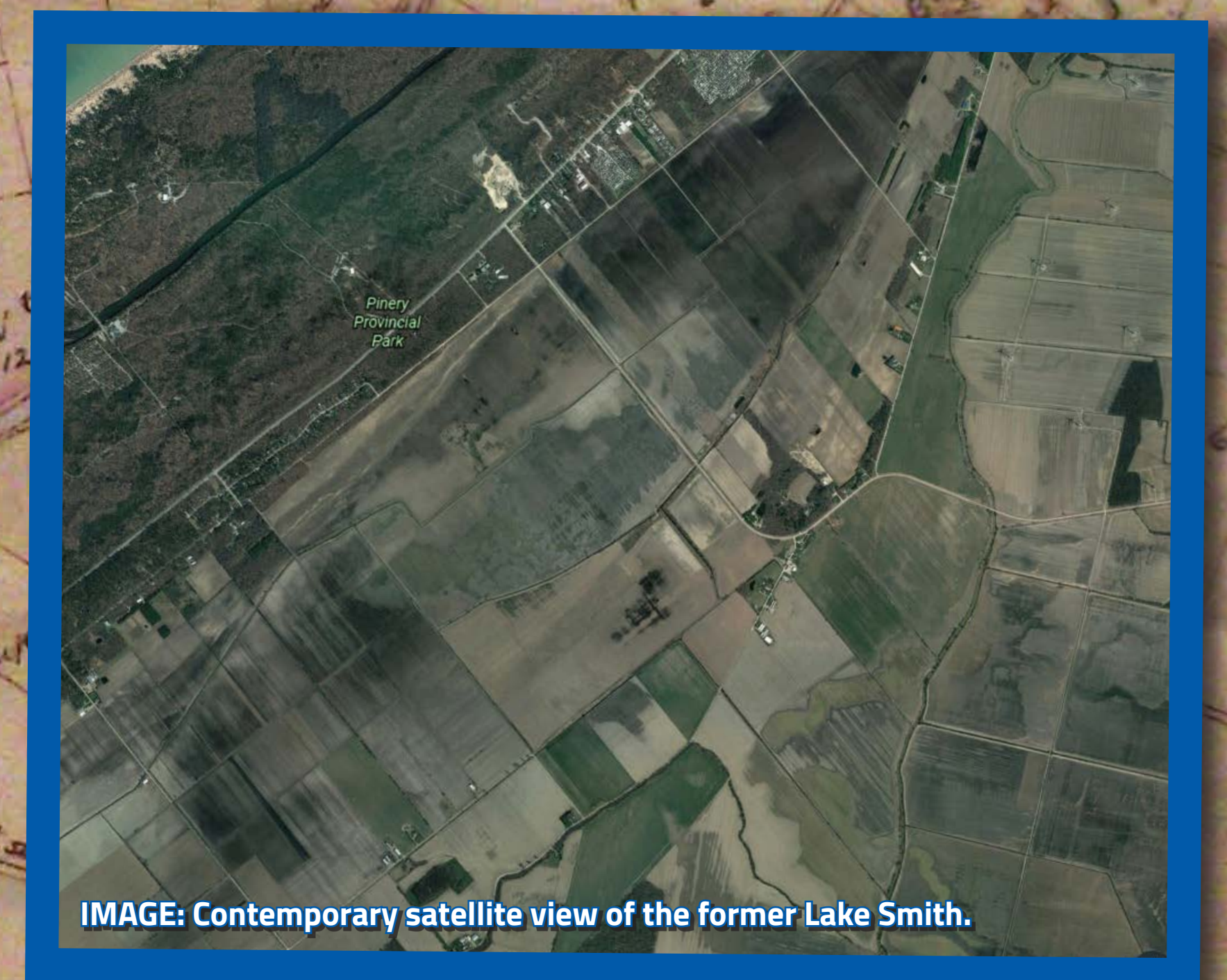
IMAGE: Contemporary satellite view of the former Lake Smith.