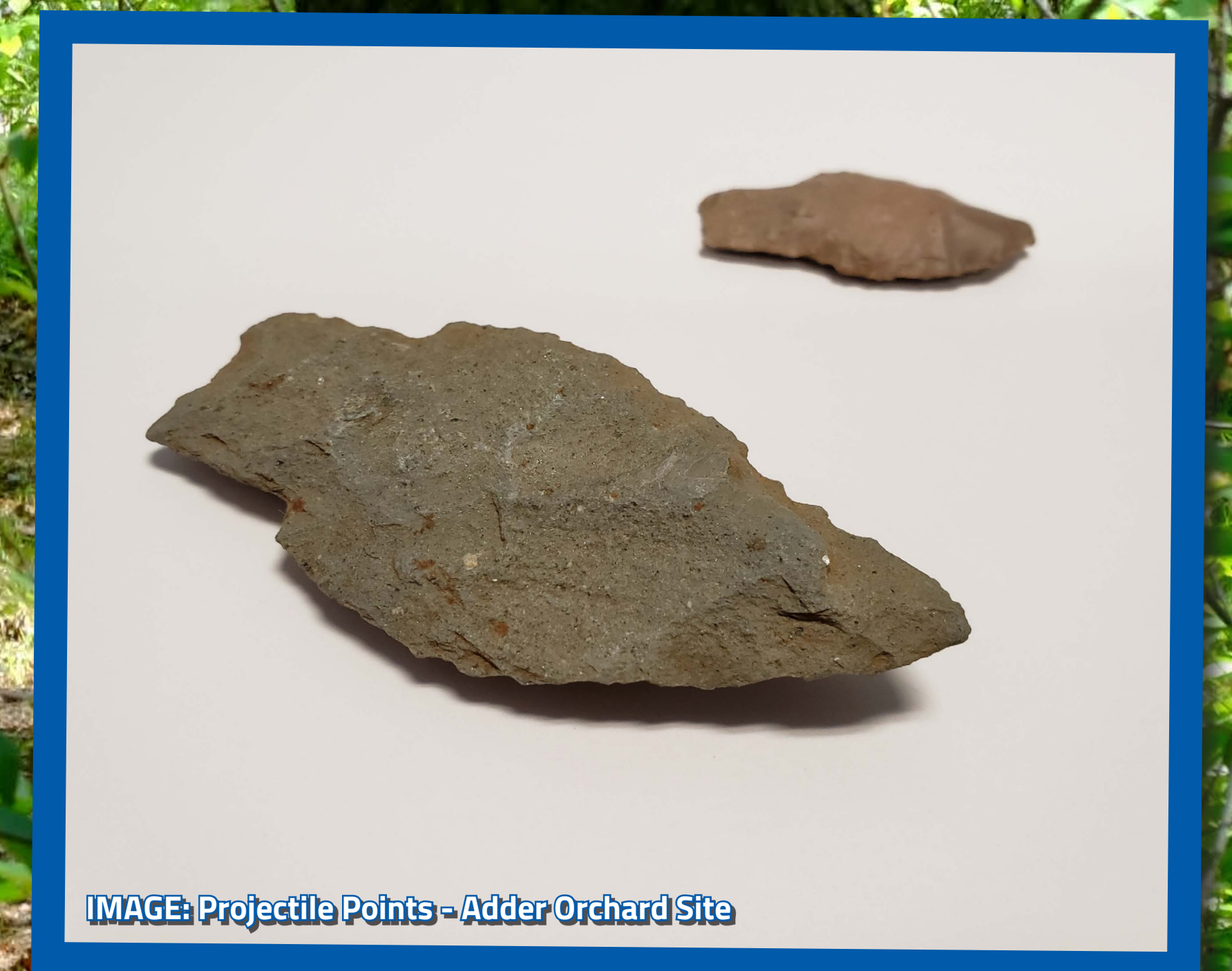
IMAGE: Projectile Points - Adder Orchard Site

Every archaeological site in Canada is given a Borden Number. This unique identifier reveals information including the geographical location of the site and the sequence in which it was found. The Adder Orchard Site's number is AgHk-16.