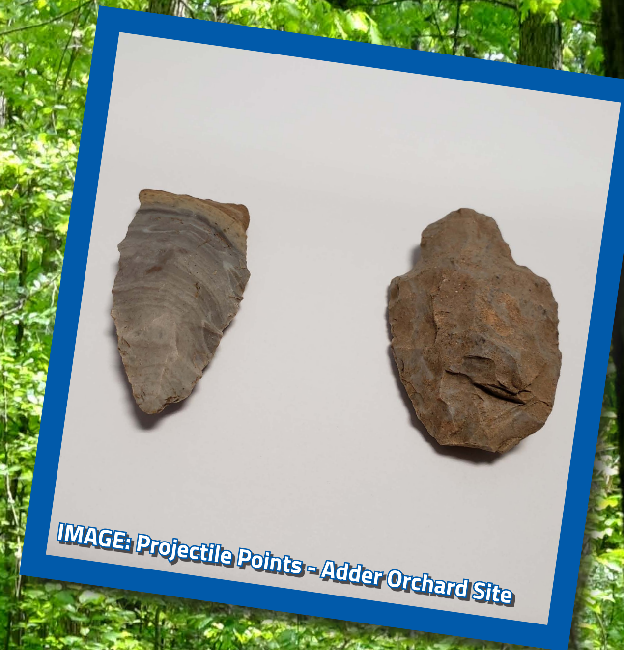
IMAGE: Projectile Points - Adder Orchard Site